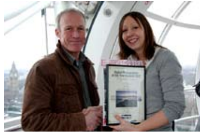
Landscape Digital Photographer of the Year Allan Coutts